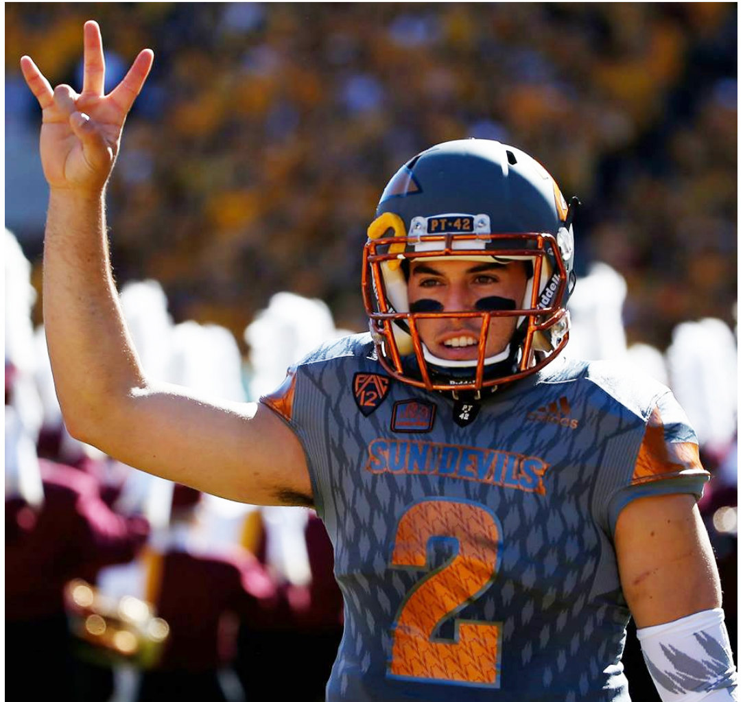
MOTEL 6 CACTUS BOWL

Arizona Science Center: 'Tis the season. Arizona Science Center's Snow Week is back for another 7 days of science wonder. They will celebrate the season with more than 60 tons of snow blanketing Heritage and Science Park's grassy hill in white. Happening daily during Snow Week 2015 include special 'explosive' demonstrations including Snowing Ping Pong Balls and DINOSAURS IN MOTION will be on exhibit until January 10th, 2016. This is the BEST time to visit Arizona Science Center with out-of-town friends and family for some winter fun. 10 am to 5 pm. 600 E. Washington St. 602-716-2000 azscience.org