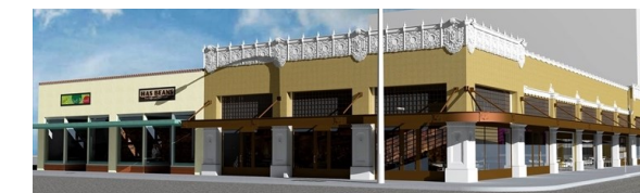
From top: Residences at CityScape; Containers on Grand (construction); Proxy333 (construction); 11 & 12 Capital Place (construction); Linear (construction); Welnick Marketplace (rendering)

The Historic Welnick Marketplace is being redeveloped, bringing more than 11,000 square feet of restaurant and retail space to 345 W. Van Buren. Available suites will range in size from 965 to 2,419 square feet and work is expected to be complete in 2016. The Spanish Colonial style building was built in 1927 to house a grocery business.