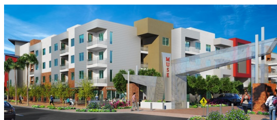
From top: Union @ Roosevelt (rendering); Roosevelt Point; En Hance Park (rendering); Alta Fillmore (site); The FoundRe (rendering); The Scheduling Institute; Muse (rendering)