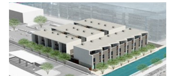
From top: Broadstone Arts District (site); Arizona Cancer Center; Health Sciences Education Building; U of A Biosciences Partnership Building (construction); Townhomes on 3rd; Portland on the Park (construction)

25 units with varying floor plans are under construction on First Avenue near Central and McDowell. The project is designed to take advantage of the artistic amenities in the neighborhood, namely the Phoenix Art Museum. Construction began this summer and will be complete in May 2016.