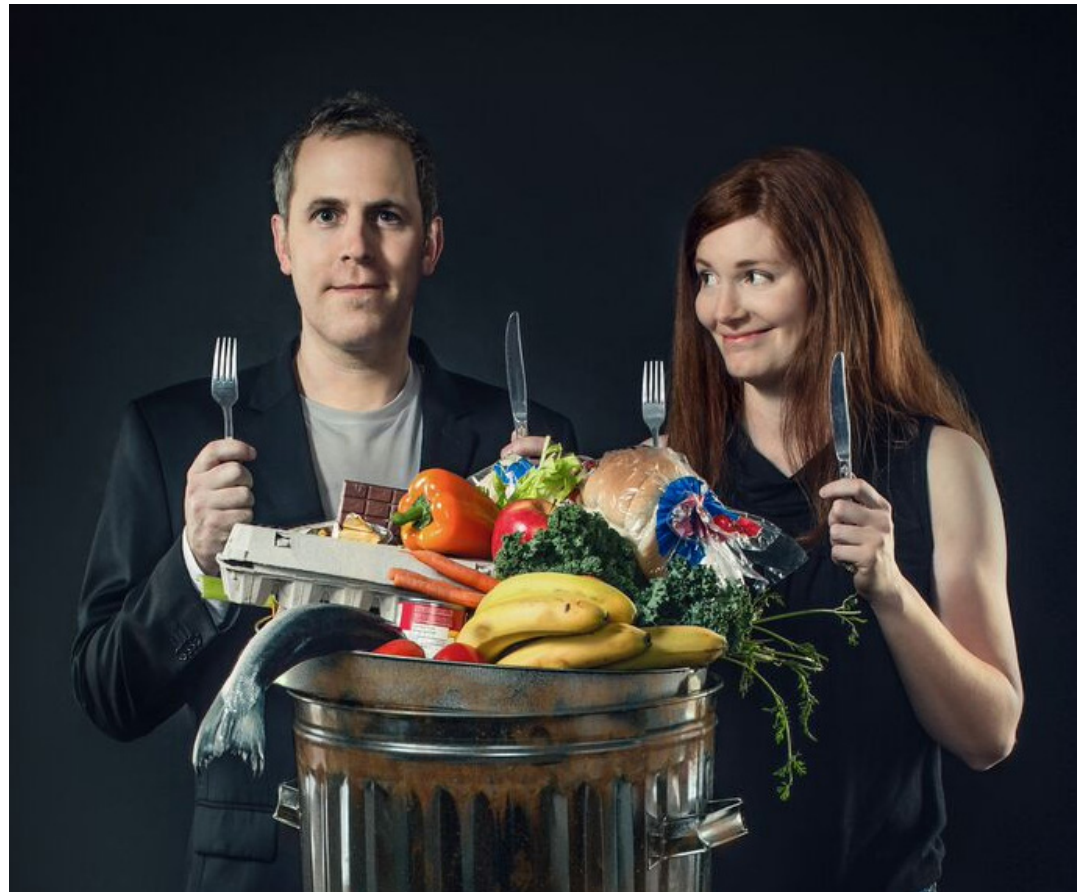
JUST EAT IT - A FOOD WASTE STORY

Motown On Mondays Crescent Ballroom: With DJ Tricky T, Pickster, and DJ MTWO. 10:30 pm. Free. 308 N. 2nd Ave 602-716-2222 crescentphx.com