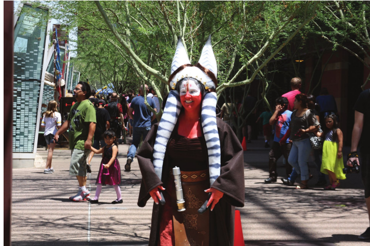
Ahsoka Tano outside the Phoenix Convention Center during Comicon.