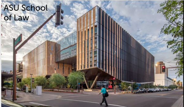
ASU School of Law

Arizona State University is fully established in Downtown Phoenix with over $219 million invested to create the 12,000 student. Nine city blocks accommodate multiple colleges and Civic Space Park. The most recent project is the Arizona Center for Law and Society, that opened in August 2016. This large increase in the downtown student and academic population has infused the streets with life and offered expanded retail opportunities. Thunderbird School of Global Management will soon start construction on their new building south of the law school.