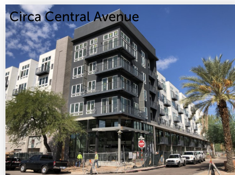
Circa Central Avenue

A joint venture between Ryan Companies, Hunt Investment and Tilton Development, Circa Central Avenue is a 5-story, 220-unit mixed-use residential and live-work space on the north-east corner of Central and Willetta St. Construction completed in January 2019. Now leasing.