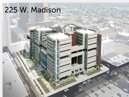
225 W. Madison