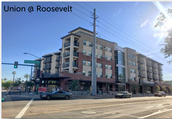
Union @ Roosevelt