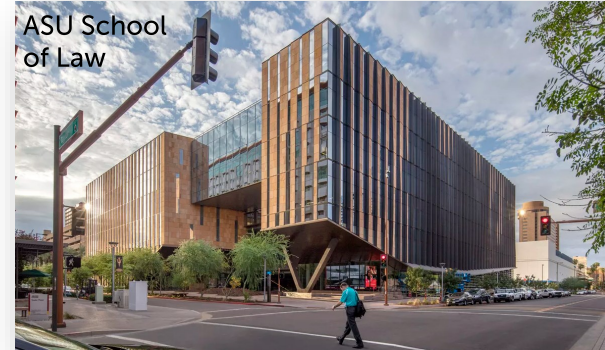
ASU School of Law

Arizona State University is fully established in Downtown Phoenix with over $219 million invested to create the 12,000 student. Nine city blocks accommodate multiple colleges and Civic Space Park. The most recent project is the Arizona Center for Law and Society, that opened in August 2016. This large increase in the downtown student and academic population has infused the streets with life and offered expanded retail opportunities. Thunderbird School of Global Management will soon start construction on their new building south of the law school.