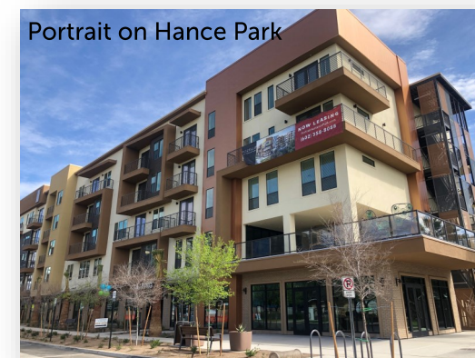
Portrait on Hance Park

Transwestern has almost completed construction on a residential development located at 3rd Street and Willetta. The project will include 325 residential units, ground-floor retail and an elevated pedestrian bridge.