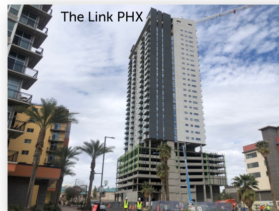
The Link PHX