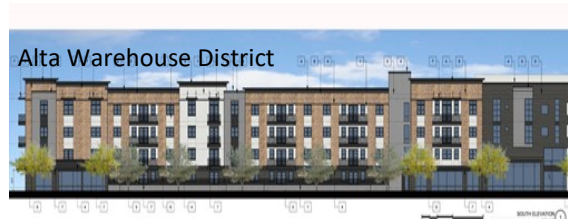
Alta Warehouse District