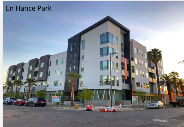
En Hance Park

Sencorp completed construction of 49 luxury condominiums in 2017 on the southeast corner of 2nd Street and Moreland, across the street from Margaret T. Hance Park. Units are available for purchase.