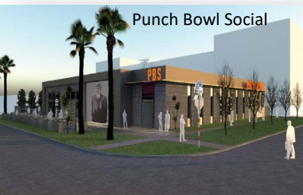
Punch Bowl Social