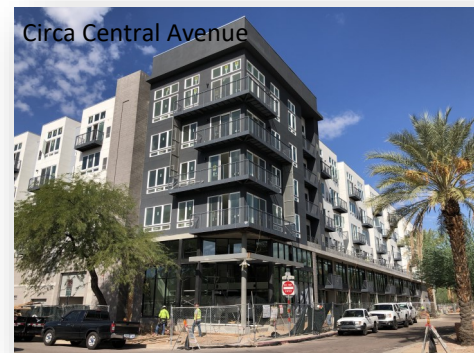
Circa Central Avenue

A joint venture between Ryan Companies, Hunt Investment and Tilton Development, Circa Central Avenue is a 5-story, 220-unit mixed-use residential and live-work space on the northeast corner of Central and Willetta St. Construction completed in January 2019. Now leasing.