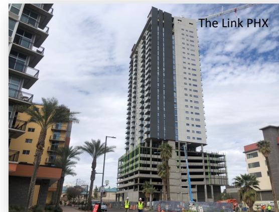
The Link PHX