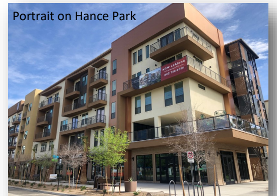
Portrait on Hance Park

Transwestern has almost completed construction on a residential development located at 3rd Street and Willetta. The project will include 325 residential units, ground-floor retail and an elevated pedestrian bridge. Now leasing.