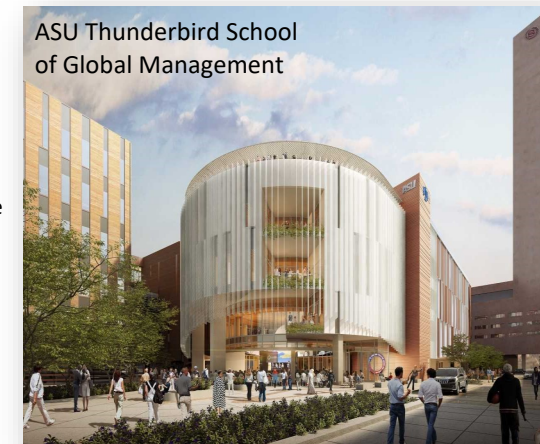
ASU Thunderbird School of Global Management

Trammel Crowe will soon break ground on the first phase of a $140-million mixed-use project between 4th-6th Avenue fronting Fillmore. Set to complete in Q4 2020, The Fillmore phase 1 will feature 342 units with ground floor retail and amenity space on the SW corner of 4th Ave and Fillmore. The second phase will include 350 apartment units.