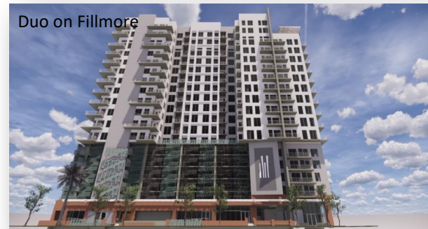
Duo on Fillmore