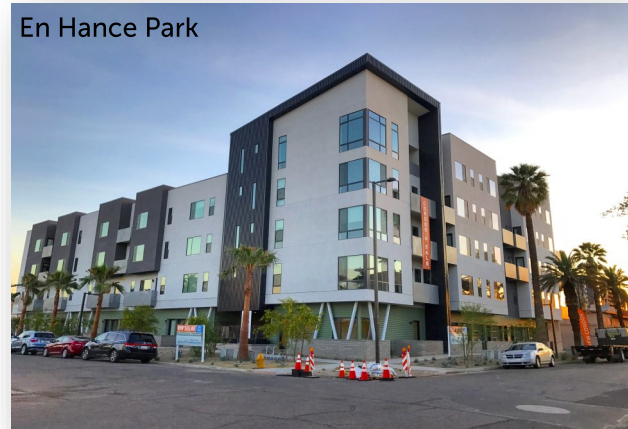
En Hance Park

Sencorp completed construction of 49 luxury condominiums in 2017 on the southeast corner of 2nd Street and Moreland, across the street from Margaret T. Hance Park. Units are available for purchase.