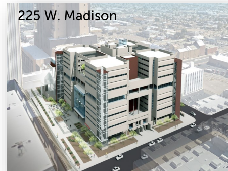
225 W. Madison