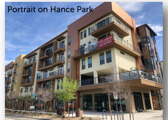
Portrait on Hance Park

Transwestern has almost completed construction on a residential development located at 3rd Street and Willetta. The project will include 325 residential units, ground-floor retail and an elevated pedestrian bridge. Now leasing.