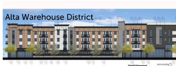
Alta Warehouse District

Wood Partners have begun work on a 300-unit apartment project on a long-vacant parcel at the NE corner of 7th Avenue and Lincoln. The completed project will feature ground-floor activated working spaces and amenities within the blossoming Warehouse District. Scheduled to open Q2 2020.