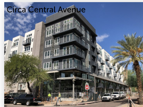
Circa Central Avenue

A joint venture between Ryan Companies, Hunt Investment and Tilton Development, Circa Central Avenue is a 5-story, 220-unit mixed-use residential and live-work space on the north-east corner of Central and Willetta St. Construction completed in January 2019. Now leasing.