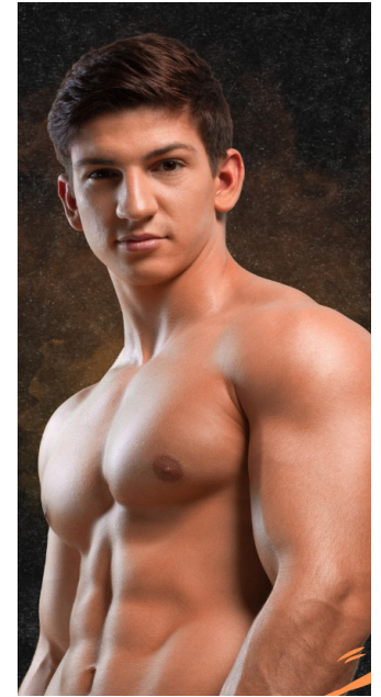
OCB Slayer Classic • 8/6

ONE WORLD, ONE SKY - BIG BIRD'S ADVENTURE Arizona Science Center: Dorrance Planetarium. $9 plus general admission. Weekends 11:00 AM. 600 E Washington St 602-716-2000 azscience.org