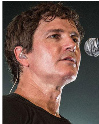
Third Eye Blind • 8/4

THIRD EYE BLIND Arizona Financial Theatre: Summer Gods Tour 2022 . $36 - $99. 7:00 PM. 400 W Washington St 602-379-2800 livenation.com