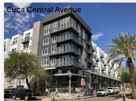
Circa Central Avenue

A joint venture between Ryan Companies, Hunt Investment and Tilton Development, Circa Central Avenue is a 5-story, 220-unit mixed-use residential and live-work space on the north-east corner of Central and Willetta St. Construction completed in January 2019. Now leasing.