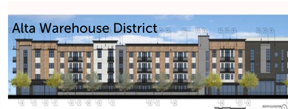
Alta Warehouse District