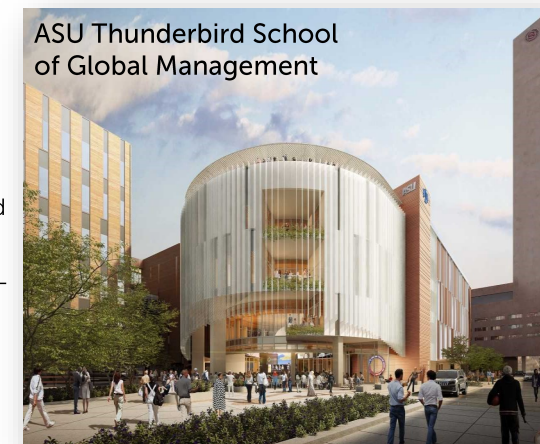
ASU Thunderbird School of Global Management

Arizona State University is fully established in Downtown Phoenix with over $219 million invested to create the 12,000 student. Nine city blocks accommodate multiple colleges and Civic Space Park. The most recent project is the Arizona Center for Law and Society, that opened in August 2016. This large increase in the downtown student and academic population has infused the streets with life and offered expanded retail opportunities. Thunderbird School of Global Management will soon start construction on their new building south of the law school.