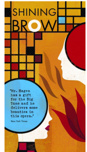
Shining Brow • 9/27 - 9/29

THE MIRACULOUS JOURNEY OF EDWARD TULANE - CHILDSPLAY THEATRE Herberger Theater Center: One of Childsplay's most beloved productions returns to the stage! Stage West. $12 - $35. 1:00 PM & 4:00 PM. 222 E Monroe St 602-254-7399 herbergertheater.org