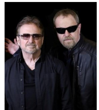
Blue Oyster Cult • 9/29

NEW FACES OF COMEDY OPEN MIC Stand Up Live: $5. 7:00 PM. 50 W Jefferson St 480-719-6100 standuplive.com