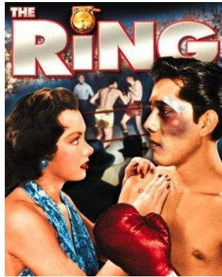
The Ring • 9/26

WINE SEANCE The Farish House: Sample 4-5 wines and paired appetizers... maybe you'll see a ghost. $25. 5:30 - 6:30 PM. 816 N 3rd St 602-281-6659 farishhouse.com