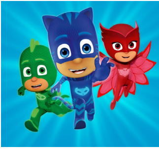
Phoenix Famtastical Festival • 9/28

VICTORIAN SECRETS: THE UNMENTIONABLE TOUR Rosson House: $25. 5:00 PM. 113 N 6th St 602-262-5070 heritagesquarephx.org