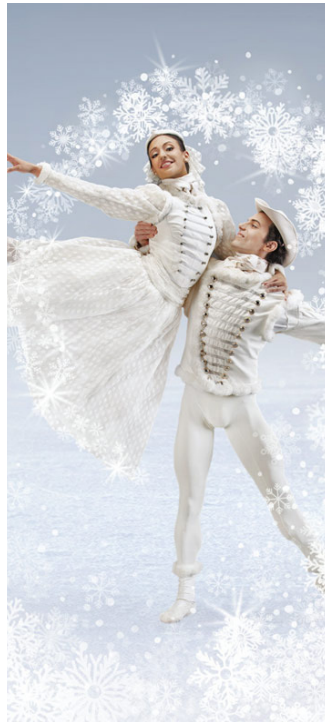
Director's Choice • 9/26 - 9/29