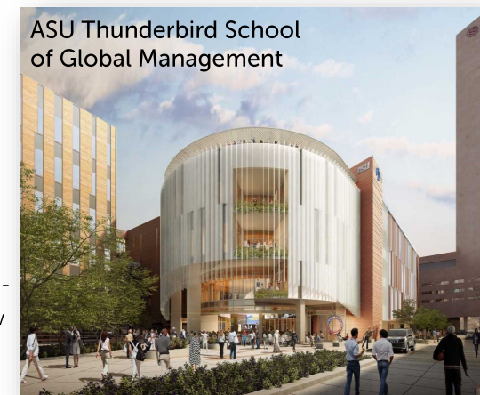
ASU Thunderbird School of Global Management

Trammel Crowe has broken ground on the first phase of a $140-million mixed-use project between 4th-6th Avenue fronting Fillmore. Set to complete in Q4 2020, The Fillmore phase 1 will feature 342 units with ground floor retail and amenity space on the SW corner of 4th Ave and Fillmore. The second phase will include 350 apartment units.