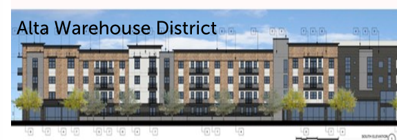
Alta Warehouse District