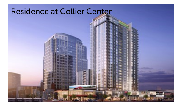
Residence at Collier Center

Hines has begun work on a 25-story multifamily project at the NW corner of Jefferson and 3rd Street in the coming months. The completed project will feature 379 luxury apartment units and more than 4,500 sq ft of retail.