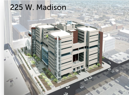
225 W. Madison