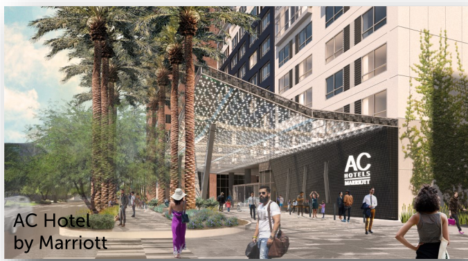
AC Hotel by Marriott