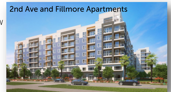
2nd Ave and Fillmore Apartments

Fore Property will soon begin work on a midrise multifamily project located at the SW corner of 2nd Avenue and Fillmore. The 7-story development will include 323 apartment units and ground-floor retail.