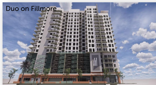
Duo on Fillmore

Expected to break ground Fall 2019, Aspirant Development will bring a 17-story, 254-unit apartment complex to the corner of Fillmore and 3rd Avenue. The project will have ground-floor retail, luxury finishes and is expected to be completed in early-2021.