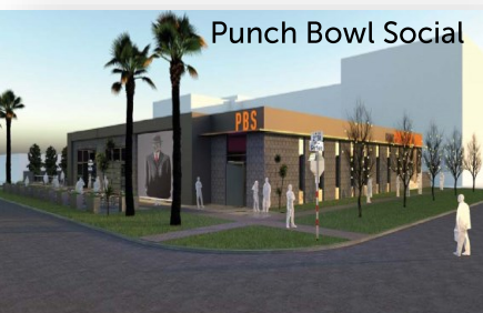
Punch Bowl Social

For more information regarding Downtown Phoenix development, log onto our website at www.downtownphoenix.com/business or contact us at (602) 744-6408.