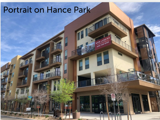
Portrait on Hance Park

This 276-unit mixed-use project is currently under construction. Located between 3rd and 4th Streets and Buchanan in the Warehouse District, the development will include for-rent apartments and commercial space. Two historic buildings will be preserved and activated as retail.