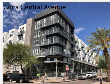
Circa Central Avenue

A joint venture between Ryan Companies, Hunt Investment and Tilton Development, Circa Central Avenue is a 5-story, 220-unit mixed-use residential and live-work space on the north-east corner of Central and Willetta St. Construction completed in January 2019. Now leasing.