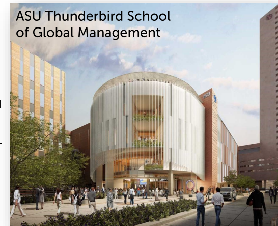
ASU Thunderbird School of Global Management

Arizona State University is fully established in Downtown Phoenix with over $219 million invested to create the 12,000 student. Nine city blocks accommodate multiple colleges and Civic Space Park. The most recent project is the Arizona Center for Law and Society, that opened in August 2016. This large increase in the downtown student and academic population has infused the streets with life and offered expanded retail opportunities. Thunderbird School of Global Management will soon start construction on their new building south of the law school.