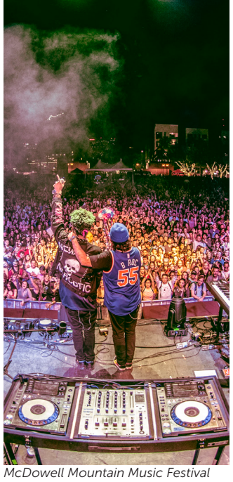
McDowell Mountain Music Festival 3/6 - 3/8

JIGGLE The Lost Leaf: No cover. 9:00 PM. 914 N 5th St 602-258-0014 thelostleaf.org