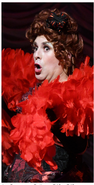
La Cage aux Folles • 3/6 - 3/8