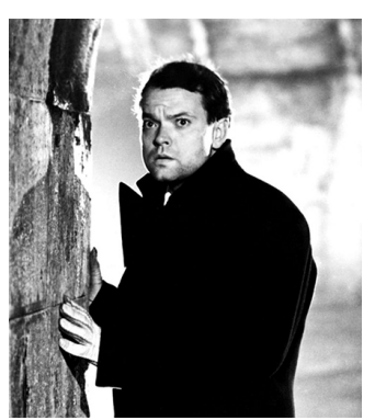
The Third Man • 3/8

EXTRA ORDINARY FilmBar Phoenix: See Friday for more details. $11. 7:00 PM & 9:00 PM.