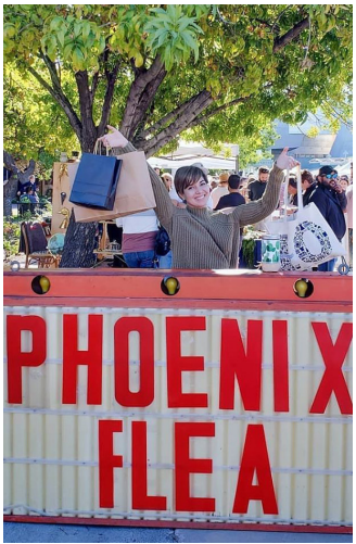
Phoenix Flea • 3/7

EXTRA ORDINARY FilmBar Phoenix: See Friday for more details. $11. 2:30 PM & 7:30 PM.