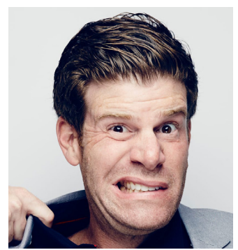
Steve Rannazzisi • 3/6 - 3/8

Talking Stick Resort Arena: Tickets start at $10. 7:00 PM. 201 E Jefferson St 602-379-2000 suns.com