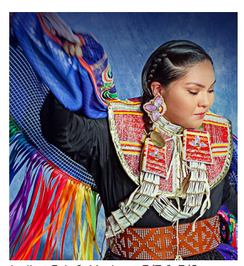
Indian Fair & Market • 3/7 & 3/8

FilmBar Phoenix: A young man's mundane existence is turned upside-down when he finds himself enrolled on a dark net website that forces complete strangers to fight in a citywide game of death with their gladiatorial battles live-streamed worldwide to a fanatical audience. $11. 8:45 PM. 815 N 2nd St 602-595-9187 thefilmbarphx.com