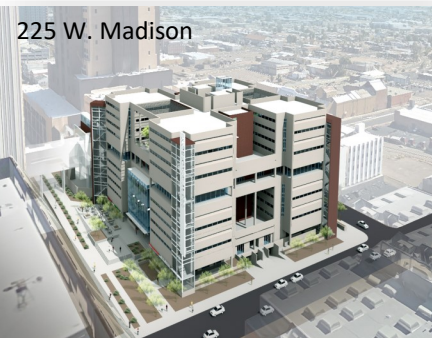
225 W. Madison