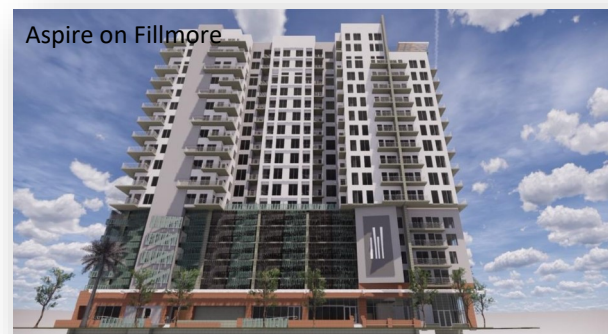
Aspire on Fillmore