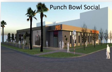
Punch Bowl Social