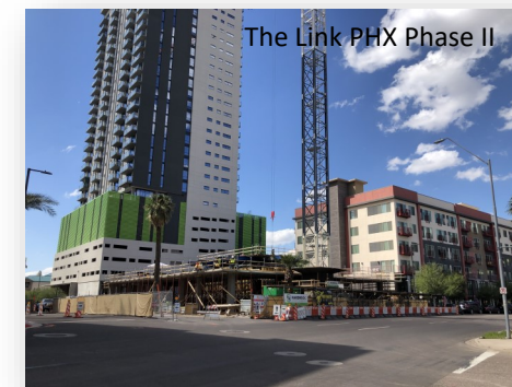
The Link PHX Phase II