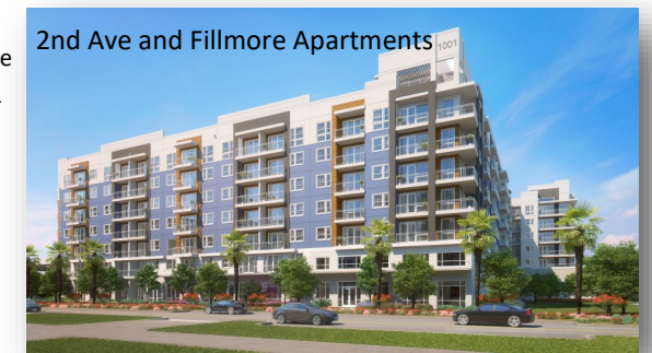
2nd Ave and Fillmore Apartments

Fore Property began work on a midrise multifamily project located at the SW corner of 2nd Avenue and Fillmore in early 2020. The 7-story development will include 323 apartment units and ground-floor retail.