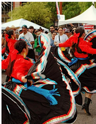
2023 Cinco de Mayo Festival • 5/7

JUAN FRANCISCO ELSO: POR AMÉRICA Phoenix Art Museum: Included with general admission ($23). 10:00 AM - 5:00 PM. 1625 N Central Ave 602-257-1880 phxart.org