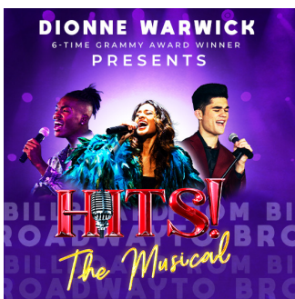
Hits! The Musical • 5/3

Arizona Center: The Rose Theatre (off the valet). $59. 7:30 PM. 400 E Van Buren St 602-271-4000 drunkshakespeare.com