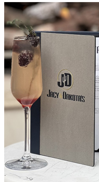
Fizzy Fridays • 5/5

Jacy & Dakota: Featuring specials on several specialty fizzy cocktails. No cover. 6:00 PM. 333 N Central Ave 602-429-3500 jacyanddakotas.com