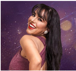
The Selena Experience - Dbacks vs Nationals • 5/5