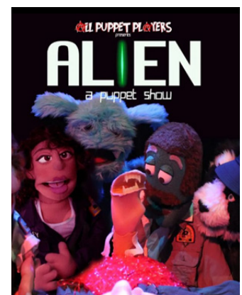
Alien: A Puppet Show • 5/5 - 5/7

Valley Bar: $23. 7:00 PM. 130 N Central Ave 602-368-3121 valleybarphx.com