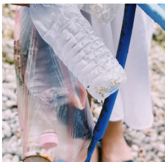
DTPHX Neighborhood Cleanup • 5/6

The Lost Leaf: No cover. 9:00 PM. 914 N 5th St 602-258-0014 thelostleaf.org