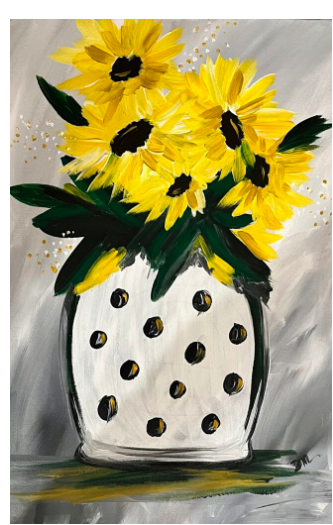
Sunflower Daze • 1/12

LET THE GOOD TIMES ROLL: A NEW ORLEANS GUMBO - FESTIVAL OF NEW AMERICAN THEATRE The Phoenix Theatre Company: See Sunday for more details. $20. 7:00 PM.