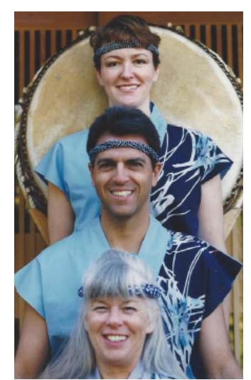
Japanese Taiko Drumming Ensemble: Fushicho Daiko Dojo • 1/13

NEW WORKS DESIGN PANEL - LET THE GOOD TIMES ROLL: A NEW ORLEANS GUMBO - FESTIVAL OF NEW AMERICAN THEATRE The Phoenix Theatre Company: $15. 3:00 PM. 1825 N Central Ave 602-254-2151 phoenixtheatre.com