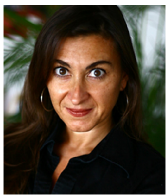
Lynsey Addario - Arizona Speaker Series • 1/10

Arizona Center: See Monday for more details. $59.7:00 PM.