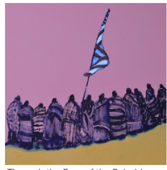
Through the Eyes of the Beholder Opening Reception • 1/12